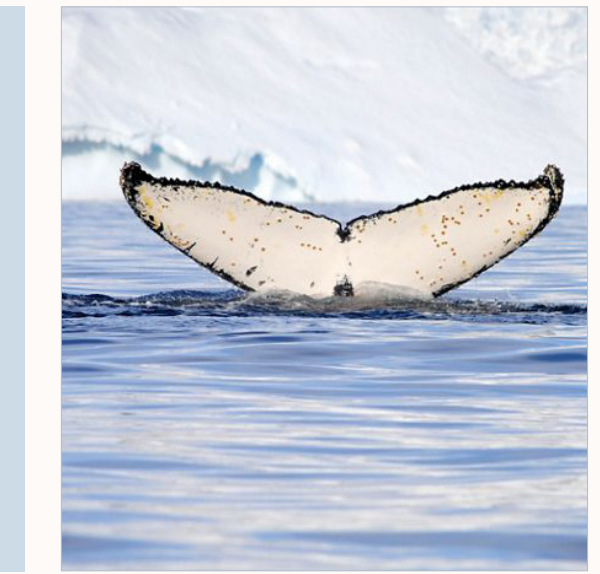
The Nature Conservanc

Nearly half the world's population—some 3.5 billion people— lives near coasts. Nature makes communities more resilient to the impacts of climate change, reefs, dunes and marshes break waves, absorb storm surges and blunt winds, greatly reducing risk to people and businesses. Healthy coral reefs can reduce the wave energy that would normally hit coastlines by 97 percent - and they protect more than 200 million people from storms globally. It is estimated that 95% of all commercially important fish species depend on coastal habitats at one stage in their life cycle.